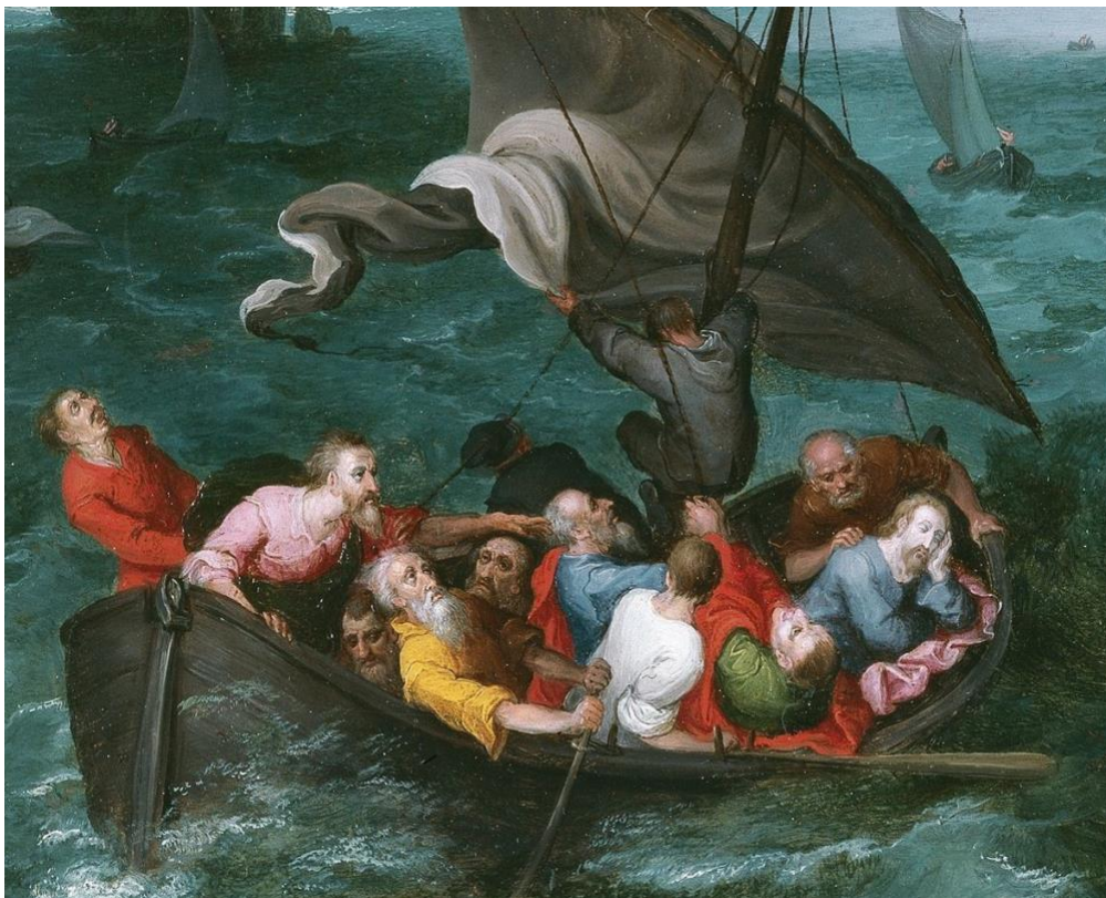
Jan Bruegel the Elder Christ in the Storm on the Sea of Galilee (detail) 1596 Museo Nacional Thyssen-Bornemisza, Madrid